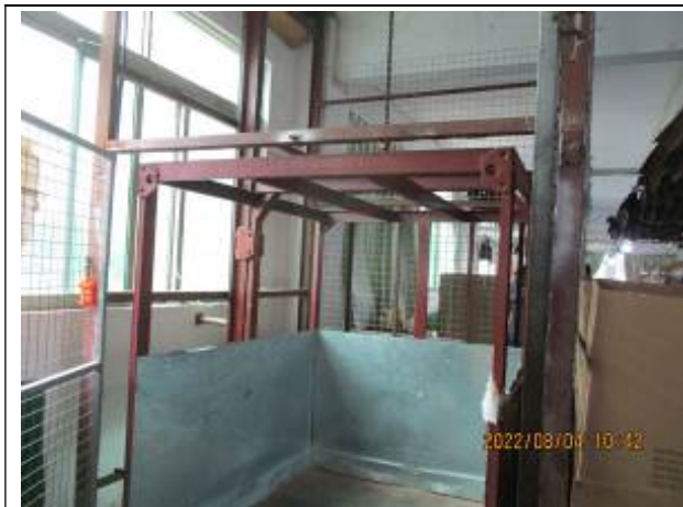
NC: No interlocking device for lift