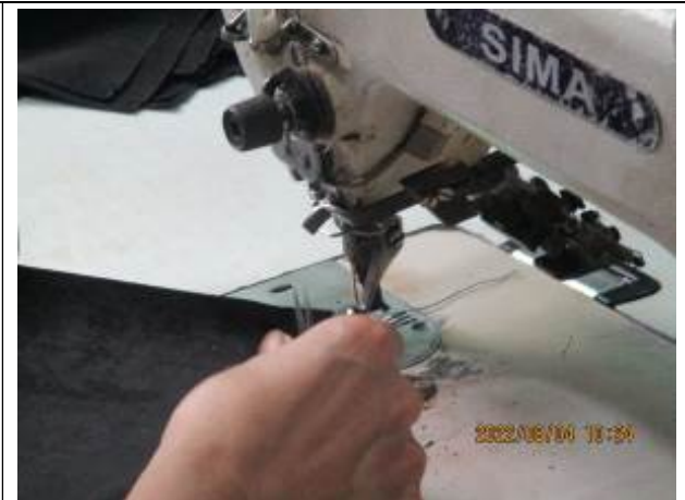
NC: In valid finger guard for sewing machines