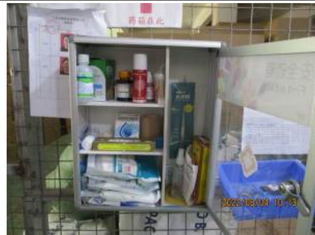
First aid kits