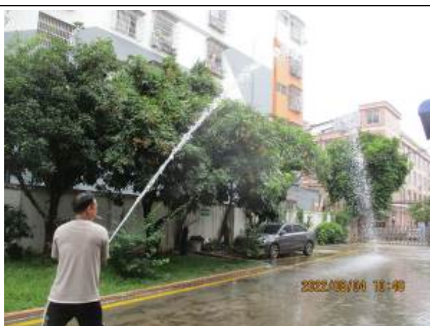
Fire hydrant test