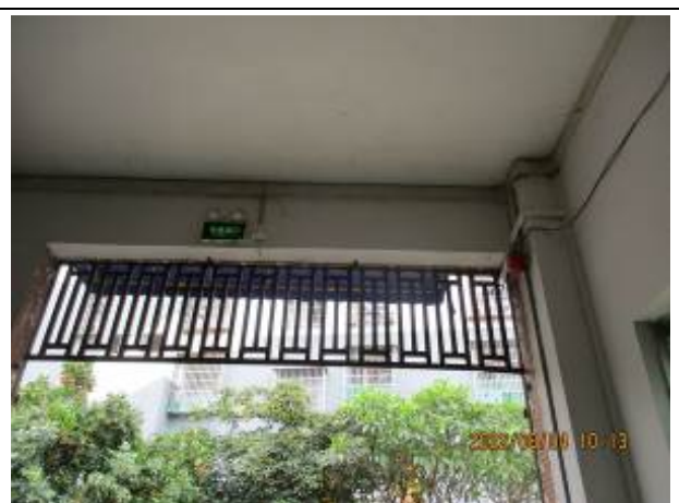
Exit sign and Emergency light