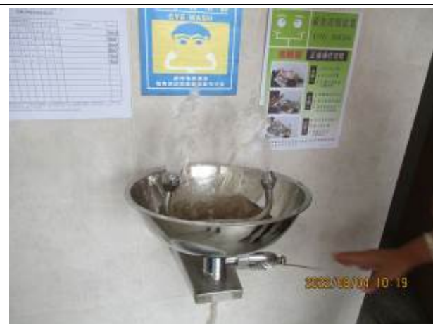
Eye washing facility