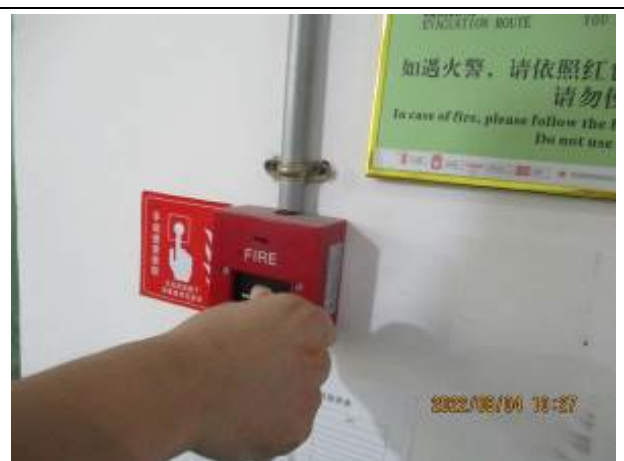
Fire alarm test