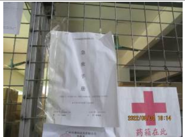
First aid guidance