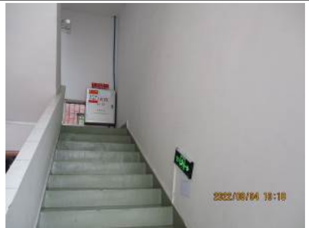
Fire hydrant and evacuation sign