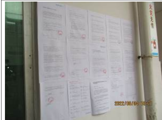
amfori BSCI code posted onsite