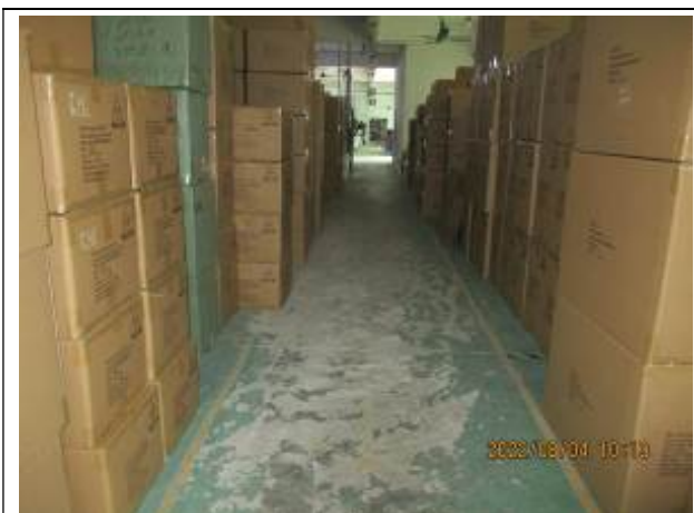
Finished goods warehouse