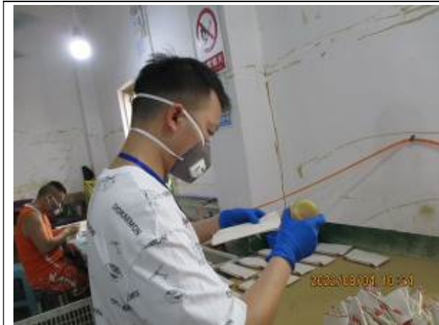
Workers exposed to glue wearing active-carbon masks and rubber gloves