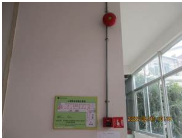
Evacuation plan and fire alarm