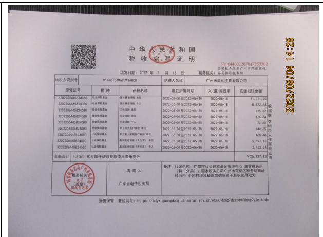
NC: Social insurance only provided for part of employees