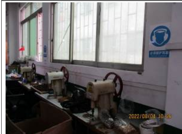
NC: No bumper and protection cover of belt pulleys for buttoning machines