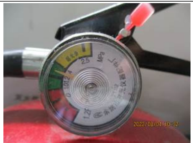
Extinguisher with sufficient air pressure