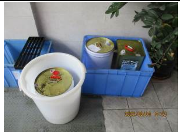
Chemical storage area