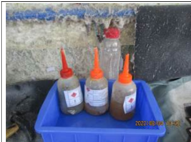
Safety label pasted for chemical