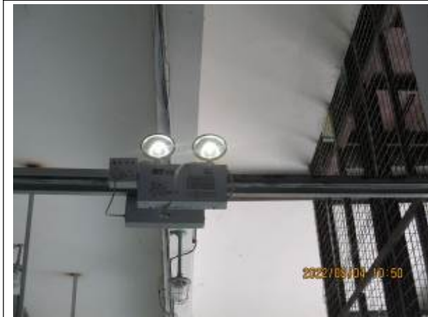
Emergency light test