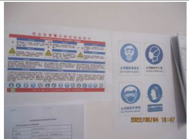
PPE warning signs and hazardous factor notices